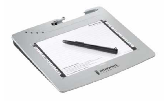
Figure 2eInstructionInterwrite Tablet and Pen

This was initially a bit of a stumbling block as it was counter to the concept of delivering courses by distance. Many of our students live and work a great distance away from the Marine Institute where the instructors maintain their offices. Some of them live in other countries or overseas. Also, based on the mathematical nature of this material, voice communications or typing was not adequate. Equation editors were useful, but slow and cumbersome to use.