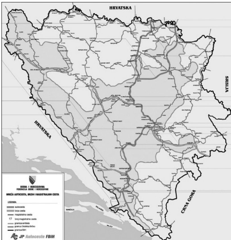
Figure 3 The network of highways, state and regional roads in Bosnia and Herzegovina