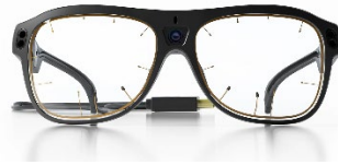
Figure 1. Tobii Glasses 3 (retrieved from https://www.tobii.com/products/eye-trackers/wearables/tobii-pro-glasses-3 ).

equipment, concurrently monitoring several screens, and physically moving inside the simulated environment. The Tobii Glasses eye tracker is a non-invasive video-based eye identification and monitoring device. It has a sampling rate of 50 Hz and a frame interval of 20 milliseconds. Based on the provided description, the Tobii 3 device is outfitted with eight Infrared illuminators, which serve the purpose of illuminating the eyes and assisting the eye-tracking sensors (Figure 1).