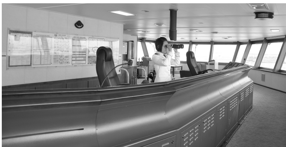
Fig.10 Miss Gong on duty at the bridge of Xue long

Miss Gong has arrived the southernmost point in the polar navigable waters and encounter different ice situation and weather condition. She gained wider experience in navigating in polar waters and gathered some useful and practical materials for the project research. Miss Gong also interviewed some skilled and veteran crewmembers for getting more information contributing to drafting the model course.