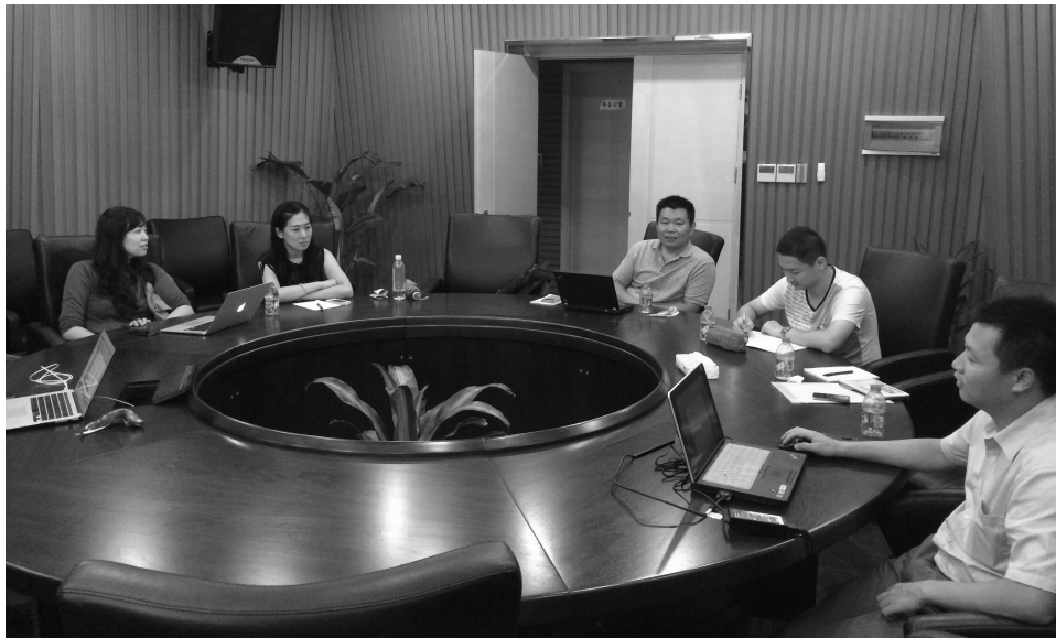
Fig.5 Discussion at 27 th Aug, 2014, Shanghai