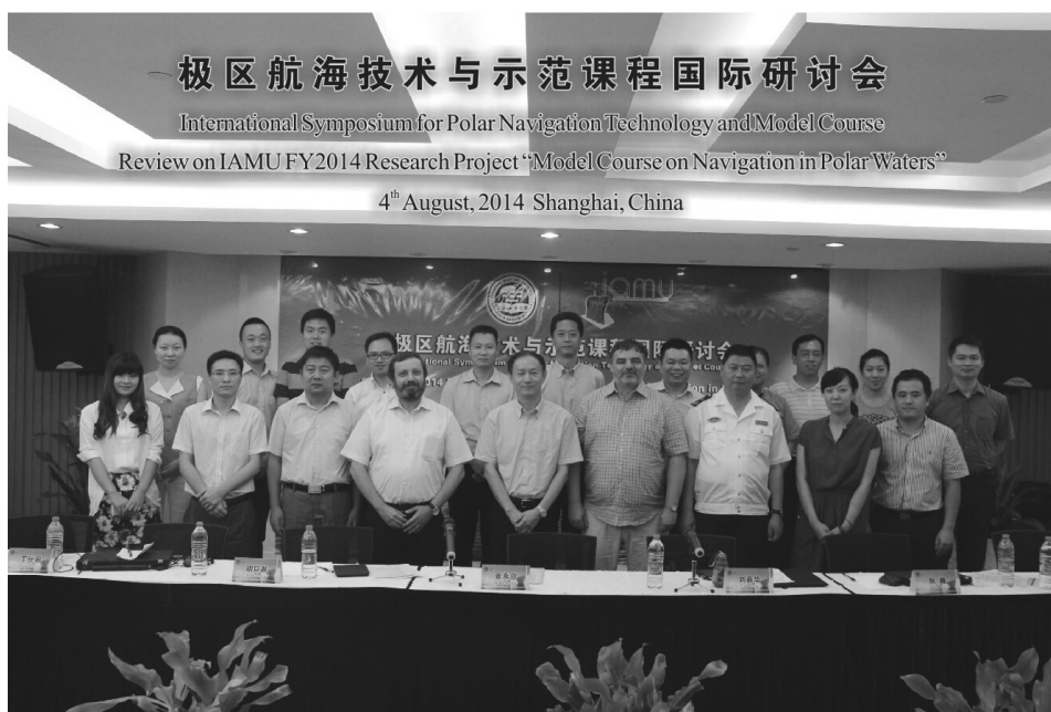
Fig.2 Group Photo taken at 4 th Aug, 2014, Shanghai