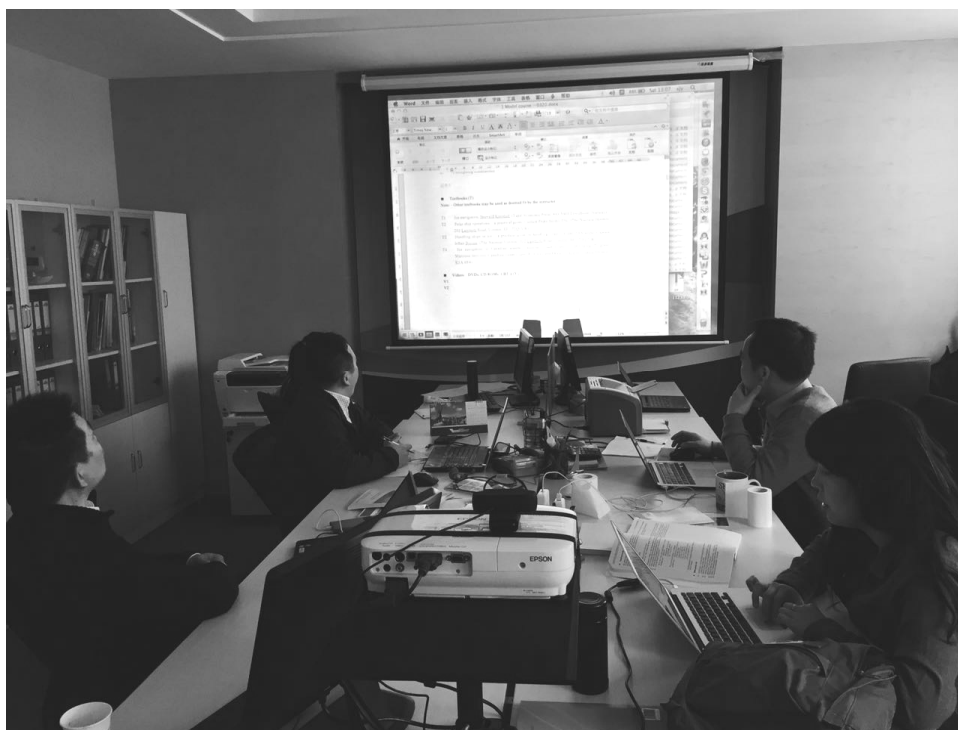
Fig.7 Discussion photo