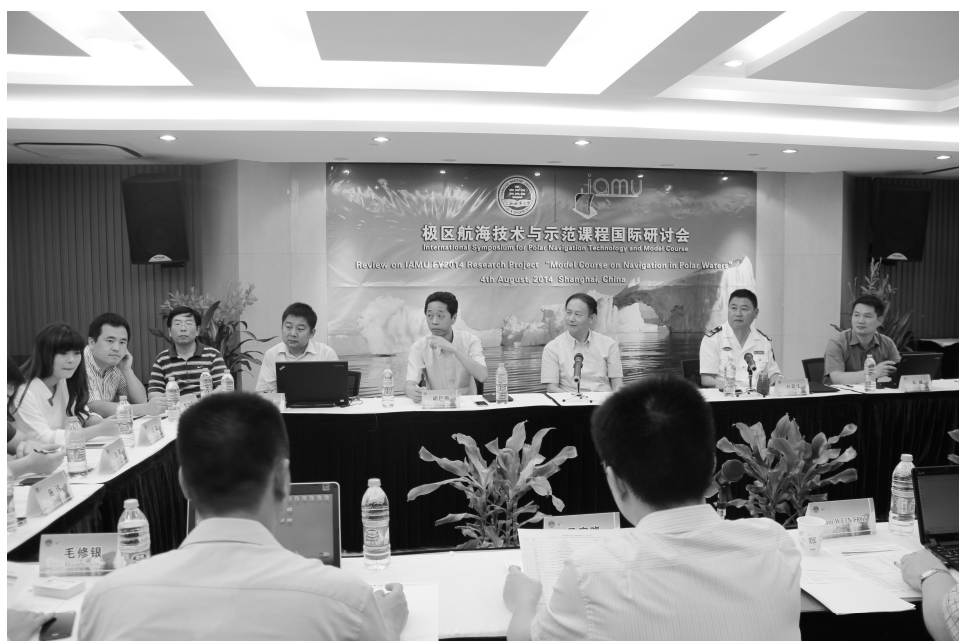
Fig.3 Conference Site taken at 4 th Aug, 2014, Shanghai