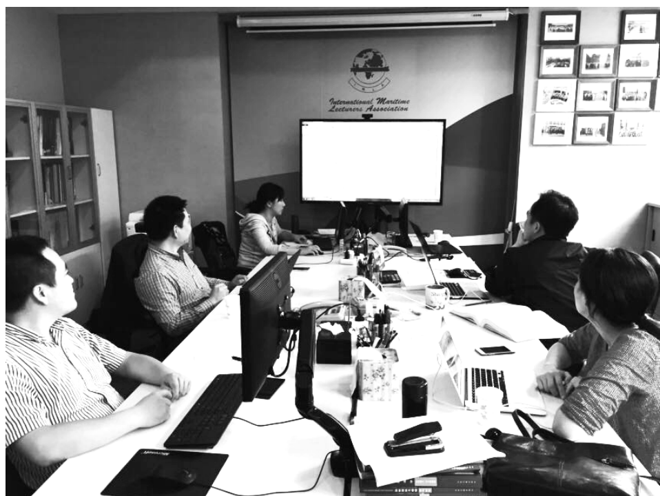
Fig.8 Discussion photo