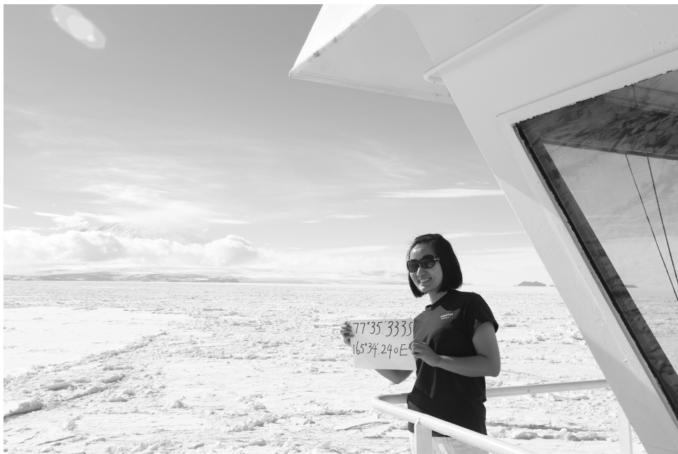
Fig.12 Miss Gong arrived the southernmost point in Antarctic waters at 30 th Dec. 2014