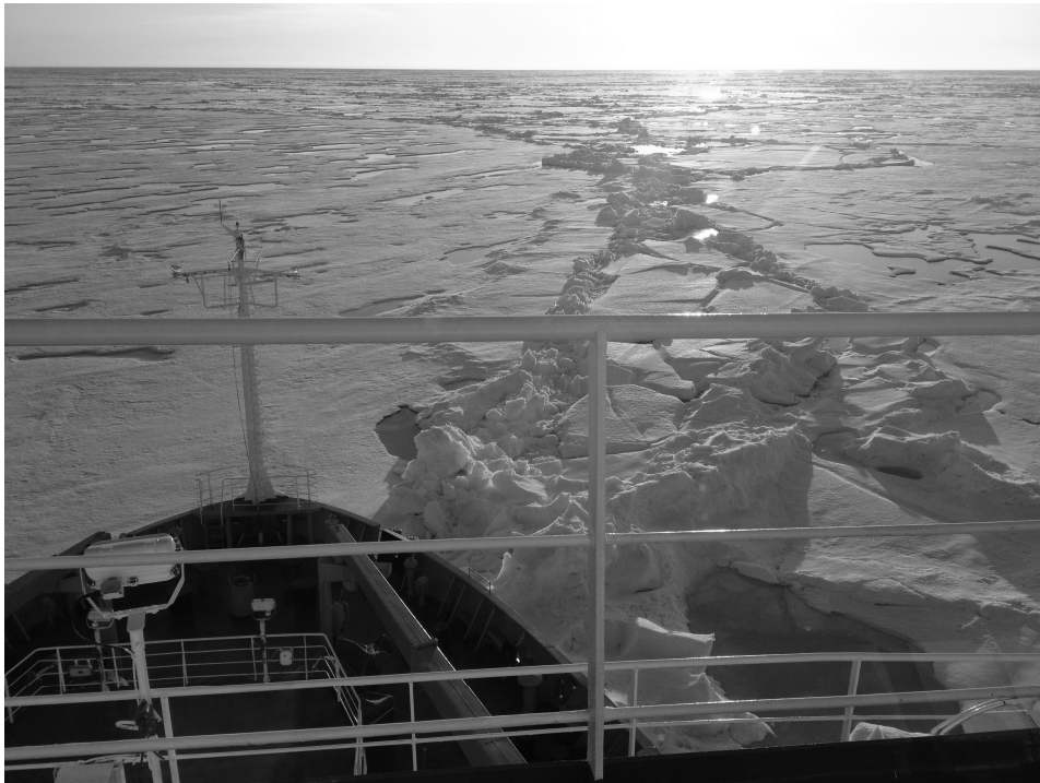
Fig.11 Thick ice blocked the route in Arctic waters at 17 th Aug. 2014