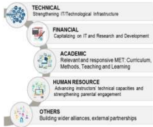
Figure 3. Future Directions for METIs

that they still meet the expected competencies as required?” Maritime institutions have channeled their priorities towards the directions shown in Figure 3 for the years ahead.