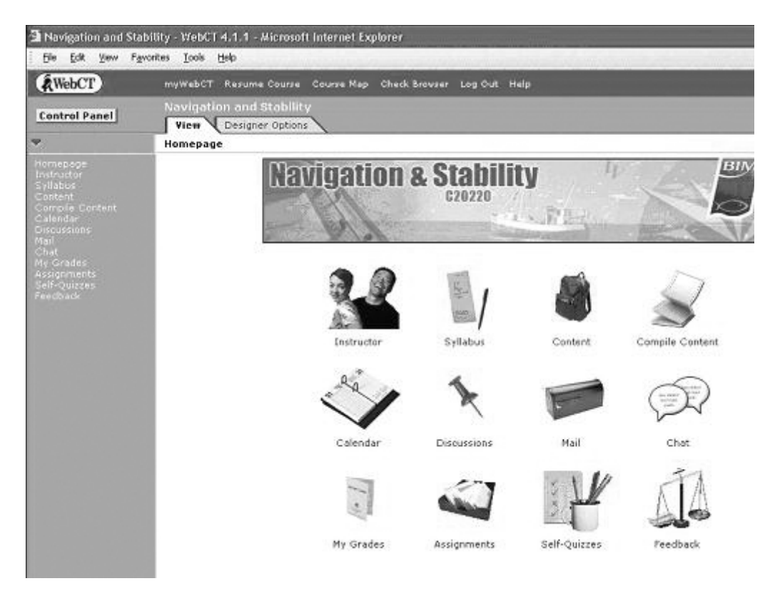
Figure 3. The Navigation and Stability WebCT course front page.

"This research and conversations with students and faculty suggest that the more interactions the better. As an administrator of a fairly large online programme [ 7500 student enrolments in 2004 academic year], I never have received a student complaint which states there was too much communication." Students expect interaction to occur in distance education with the advancements in technologies. They